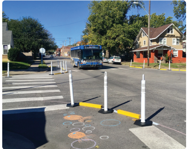
Temporary bump-outs with curbs and bollards were set up at Van Brunt & St. John for one week in October 2018. A similar design was set up at a second location, 10th & Benton for one week.

These projects included temporary bump outs to narrow the vehicle traffic lanes and shorten the crossing distance for pedestrians and painting of crosswalks by the Kansas City Missouri Public Works Department. The bump-outs were in place for 7 days at each location, and a kick-off event was held during the first day of each implementation. This infographic highlights results from 71 community surveys, in-person traffic observations, and data collection from Miovision cameras.